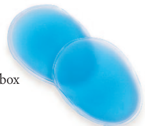
ASSI.A43343 Gel Eye Patches, 10 pair per box