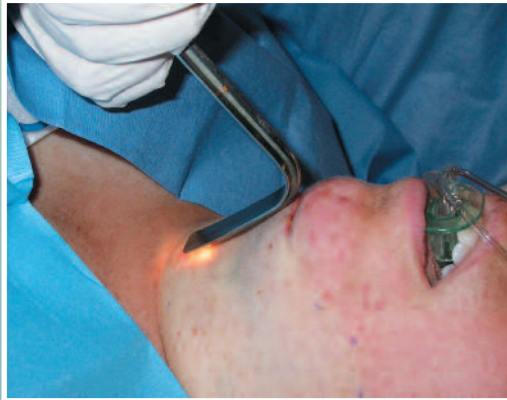
Submental Incision, showing reach of retractor

Provides Maximum Exposure and Vision for Small Incisions.