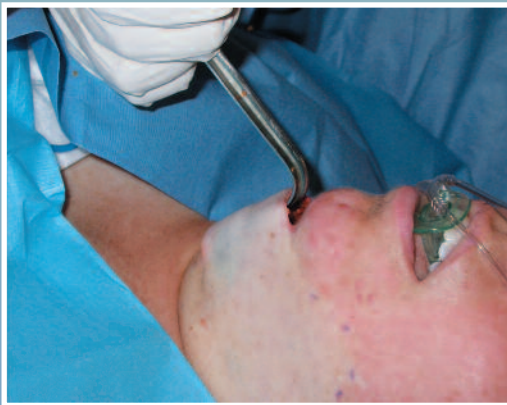
Submental Incision, retractor in place