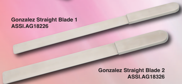
Gonzalez Straight Blade 2 ASSI.AG18326