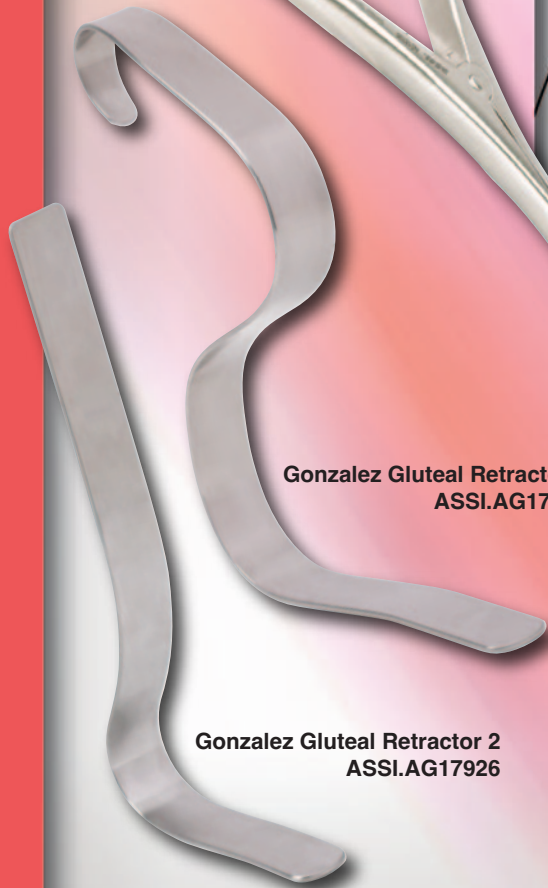
Gonzalez Gluteal Retractor 2 ASSI.AG17926