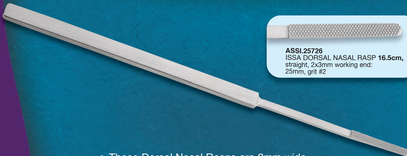
ASSI.25726 ISSA DORSAL NASAL RASP 16.5cm, straight, 2x3mm working end: 25mm, grit #2